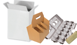
Boxboard (Dry-food boxes, egg cartons, & rolls)