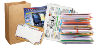
Junk Mail, Periodicals, & Office Paper (Paper bags, envelopes, & catalogs)