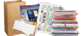
Junk Mail, Periodicals, & Office Paper (Paper bags, envelopes, & catalogs)