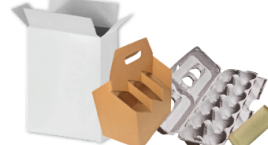
Boxboard (Dry-food boxes, egg cartons, & rolls)