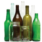
Glass Bottles & Jars (Empty food & beverage bottles & jars)