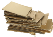
Corrugated Cardboard (Wavy center layer)