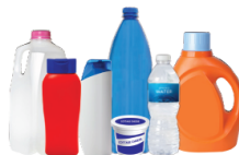
Plastic Bottles, Jugs, Tubs, & Lids (Empty kitchen, laundry, & bath containers)