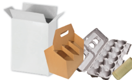
Boxboard (Dry-food boxes, egg cartons, & rolls)